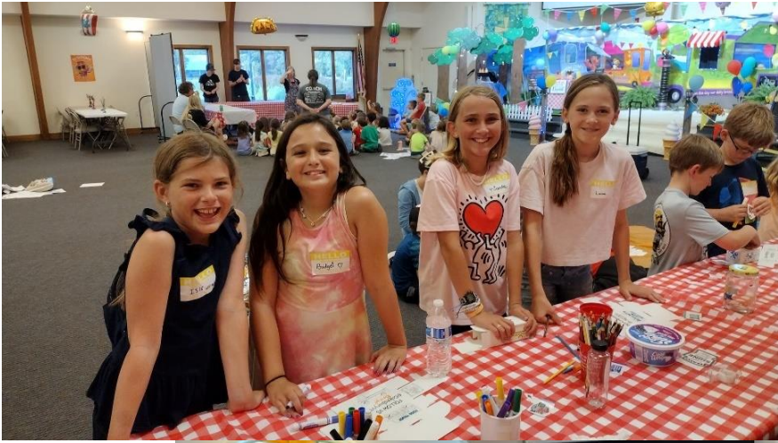
So Many Smiles!