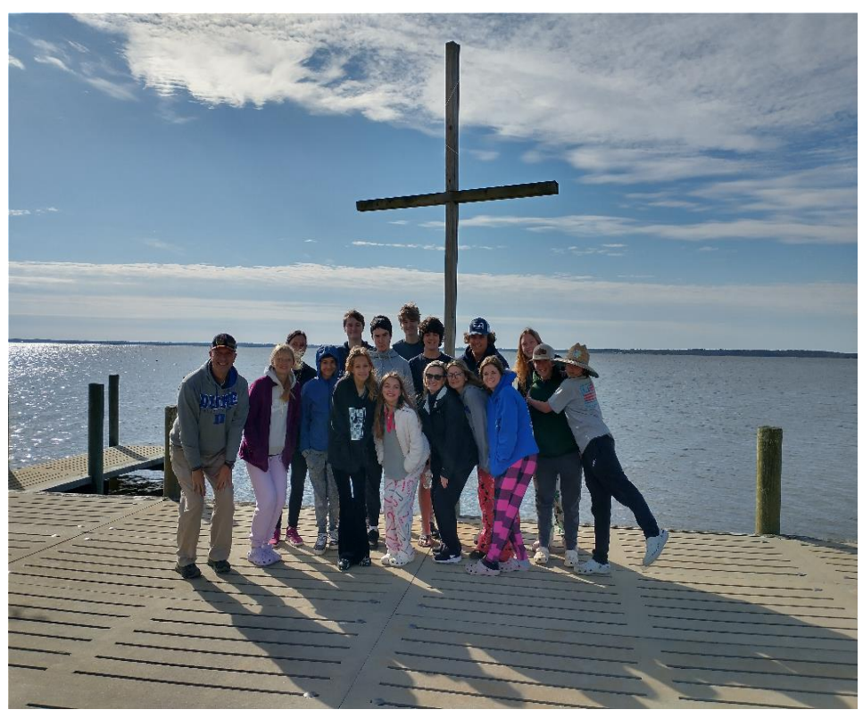
Acts 2.37: "Now when they heard this, they were cut to the heart and said to Peter and to the other apostles, 'Brothers, what should we do?'"

I love this question — "What should we do?" I oftentimes wonder why this question isn't asked as much in today's church? I think there are a variety of answers — and it mostly comes down to a movement of the Holy Spirit. That movement of the Holy Spirit prompts people to ask these kinds of deep questions that are answered by invitation and initiation. As you read further into Acts you can see that the Holy