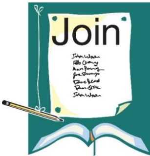
Our Bible Study!

We will be having a Spring Clean Up day on Saturday March 20 th from 9-11am. We will be weeding flower beds, trimming trees and spreading 240 bags of mulch, so if you have an hour or two please consider stopping by and lending a hand!!